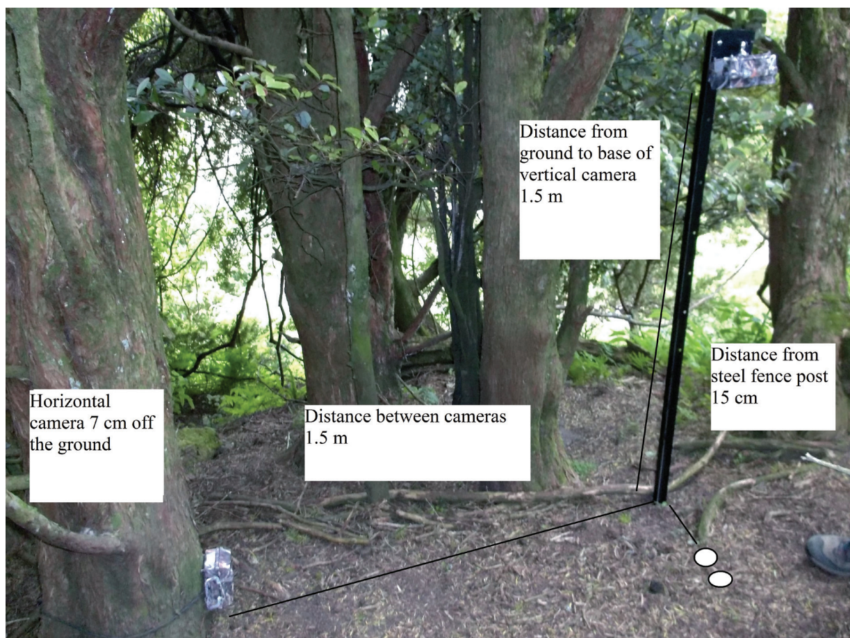
Figure 1. Setup of horizontal and vertical cameras, Toronui Station, New Zealand, in 2014. Reconyx cameras are shown below; camera models and settings are given in Table 1.

We primarily used Reconyx Hyperfire PC900 trail cameras (Reconyx Inc., Holmen, Wisconsin, USA), but also LTL Acorn 5210A (Shenzen LTL Acorn Electronics Co., Ltd, Shenzhen, Guangdong, China), M990i (Moultrie, Calera, Alabama, USA) and Bushnell (Bushnell Outdoor Products, Overland Park, Kansas, USA) (see Table 1 for camera types, specifications and settings). All cameras were chosen for their infrared flash, which is likely to be less conspicuous to cats than a white flash (Glen et al. 2013; but see also Meek et al. 2014b). Vegetation was cleared to a height of 5 cm where necessary to provide a clear view of animals in the detection zone and to avoid possible false triggers caused by moving branches or foliage (Kelly & Holub 2008; Taylor et al. 2013). Cameras were checked after 4 weeks, and batteries, memory cards (4–8 GB) and scent lures were replaced. Photos were uploaded onto an external hard drive according to their site number and orientation. All photographed animals were recorded in an Excel™ file along with any false triggers, following the methods of Allen (2014).